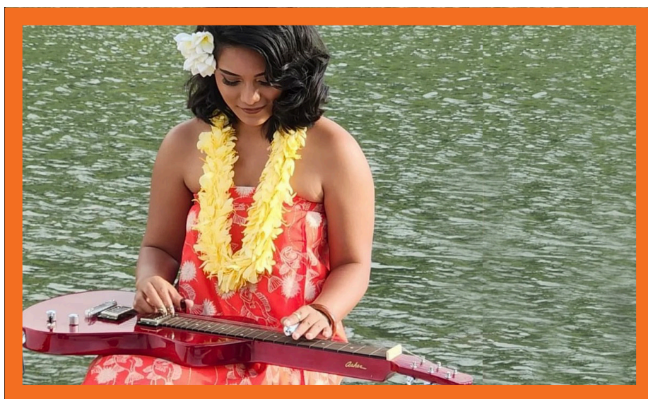
Malie Lyman headlines '23 Festival in Cupertino, California